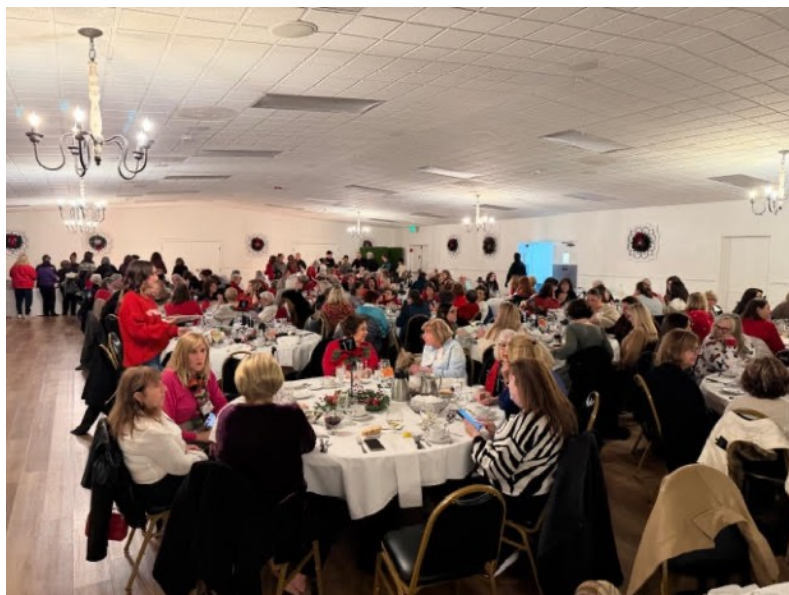
Dante Women's Club members come out in full festive force for their Dec. 8 dinner meeting, enjoying delicious food, Italian carol singing and camaraderie among their friends.