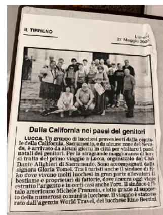
Dante Club travelers to Lucca in 2002 earn coverage in the local edition of a regional Italian newspaper. Many in the group have roots in the Lucca area.