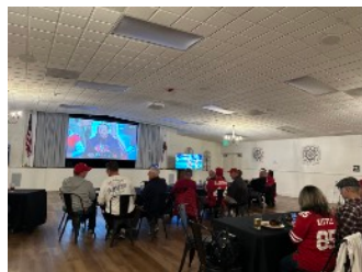
Sports fans enjoy the first Ultimate Football Watch Party in November.

We also hosted our first Ultimate Football Watch Party with great sports bar-style foods, fun raffles and drawings. We can't wait to host more parties during this football season to see the fan group grow. Be sure to mark this month's calendar for the next watch party on Dec 14.