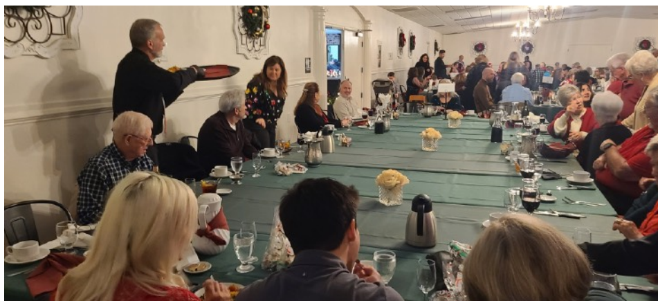
More than 250 club members and auxiliary friends enjoy the Dante Club's 2024 Christmas dinner held Dec. 22 at the Dante Event Center. Attendees enjoyed a sumptuous meal featuring four entree choices.