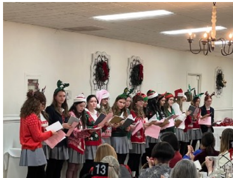
Members of the St. Francis High School Italian Club sing Christmas carols for the Women's Auxiliary.