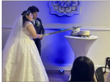
In the first wedding of the year, newlyweds cut their cake with a Samurai sword.

The buildings and grounds committee faced very few issues in January. The Dante Club's heating, ventilation and air conditioning company did come out to check and service the heating and air