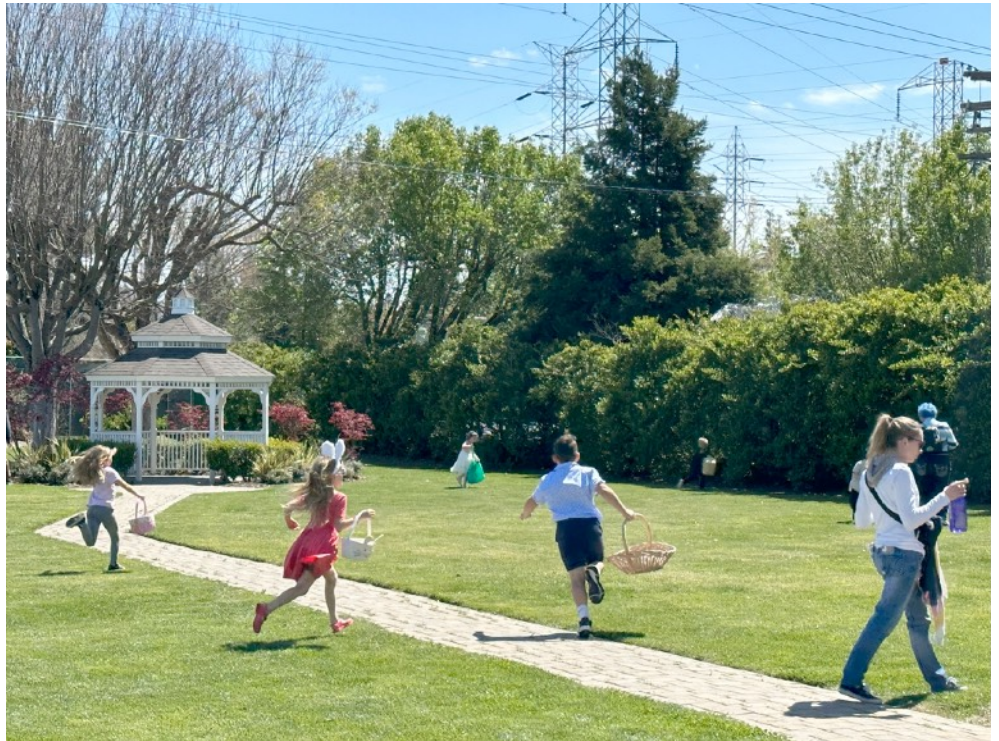
Kids delight in searching for Easter eggs in the Dante Club's annual April hunt, which also featured a bounce house.