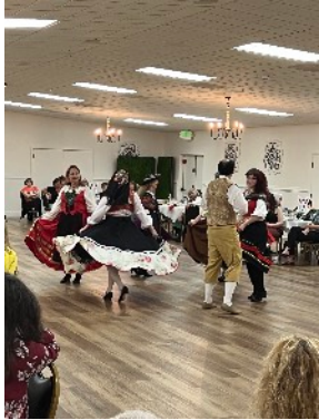
Dancers enliven the April meeting.

At our April 10 meeting, we enjoyed the costumes and stylish moves of the Italian Balliamo Dancers. The troupe of six entertained us with traditional