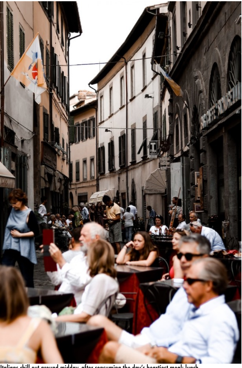
Italians chill out around midday, after consuming the day's heartiest meal: lunch.

In many areas of Italy, people take a passagiata, a