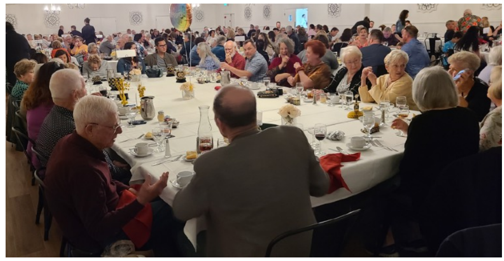
Club members and guests cluster around banquet tables for the May Family Dinner at the Dante Event Center.

Our Italian culture is often See PRESIDENT'S CORNER, Page 6