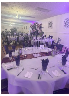
A banquet room is dressed in elegance in anticipation of a wedding reception at the Dante Event Center in May.

The Dante Club also awarded annual scholarships to 11 graduating high school students at the May members dinner.