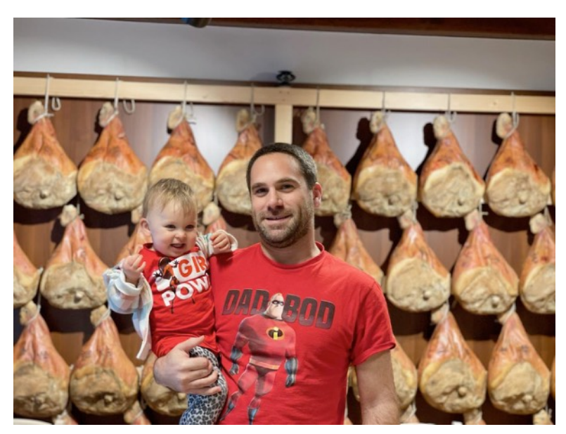
Father and daughter discover "best in the world "prosciutto in Langhirano near Parma.

From Lake Como, we drove south to Florence, taking a slight detour through Langhirano, 12 miles south of Parma, See ADVENTURE, Page 6