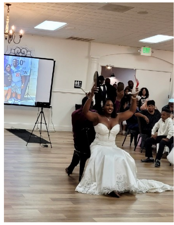
Guests, left, dance in celebration during an Aug. 18 wedding reception at the Dante Event Center. The festivities also featured the bride and groom, above, playing a newlywed game.