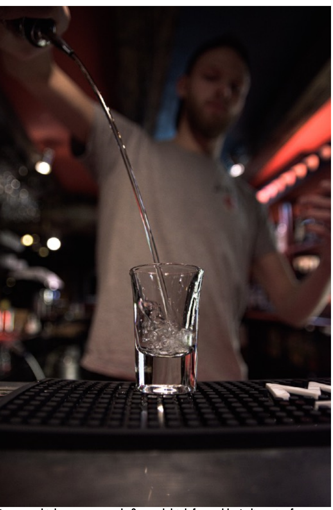
Grappa, a high-octane, strongly flavored drink favored by Italians, is often clear in color. It is made from winemaking leftovers, the grape skins and seeds.

On my first trip to Italy, when I was 21, I was invited to a friend's family cantina behind their deli. They delightedly offered flavored homemade grappa from a small cask, blueberry.