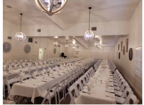
The Tuscan Room is set up for 200 attendees at a traditional Muslim wedding in August.

The event center also attracted a new branch of Sons in Retirement. Branch 23 gave the center a test run and loved it. The group plans to use the venue for its events over the long term.