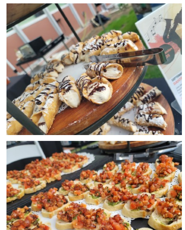
Displays of cannoli and crostini tempt attendees at the Christian Brothers Extravaganza, held at the Dante Event Center on Sept. 9.

To host an event, a member must schedule an in-person