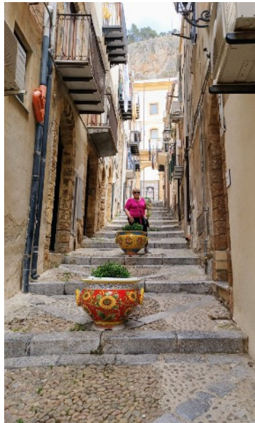
Ceramic planters adorn a Sicilian walkway. Visitors, right, take a break by a duomo.

It's important to arrive early at the departure airport in case you forgot to do or bring something.