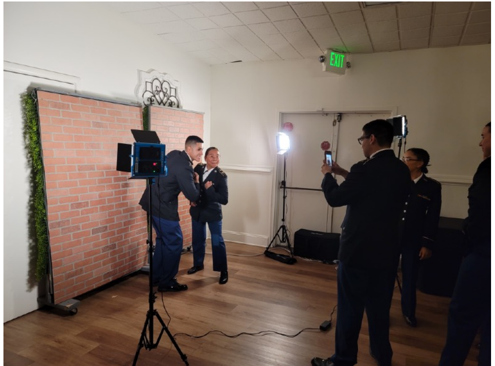
Members of the ROTC group at the University of California at Davis pose for pictures May 6 during the organization's Forged Gold Battalion Military Ball, one of many special events held at the Dante Event Center last month.