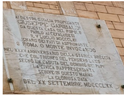
A plaque serves as a monument to Giuseppe Garibaldi, the "George Washington of Italy."

More positively, Cefalù, Palermo and the surrounding areas offer beautiful coastlines and beaches. The island of Sicily is beautiful and historic. Rome needs no promotion. I always find sights to see each time I go.