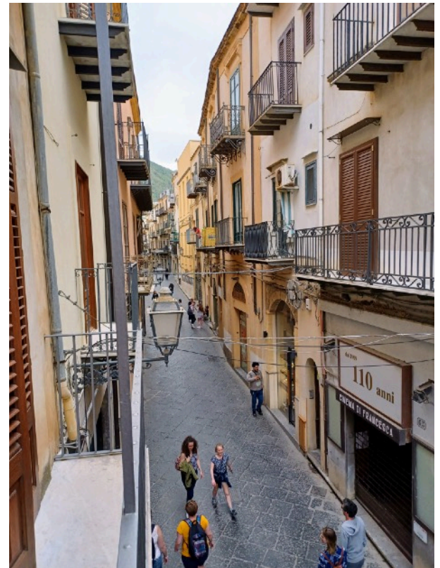
People traverse a typical narrow street between shops and homes.

In most locations and shops in Italy, masks are optional. Small shops might require them or restrict how many people can come inside. Masks are not required in restaurants or outdoors.