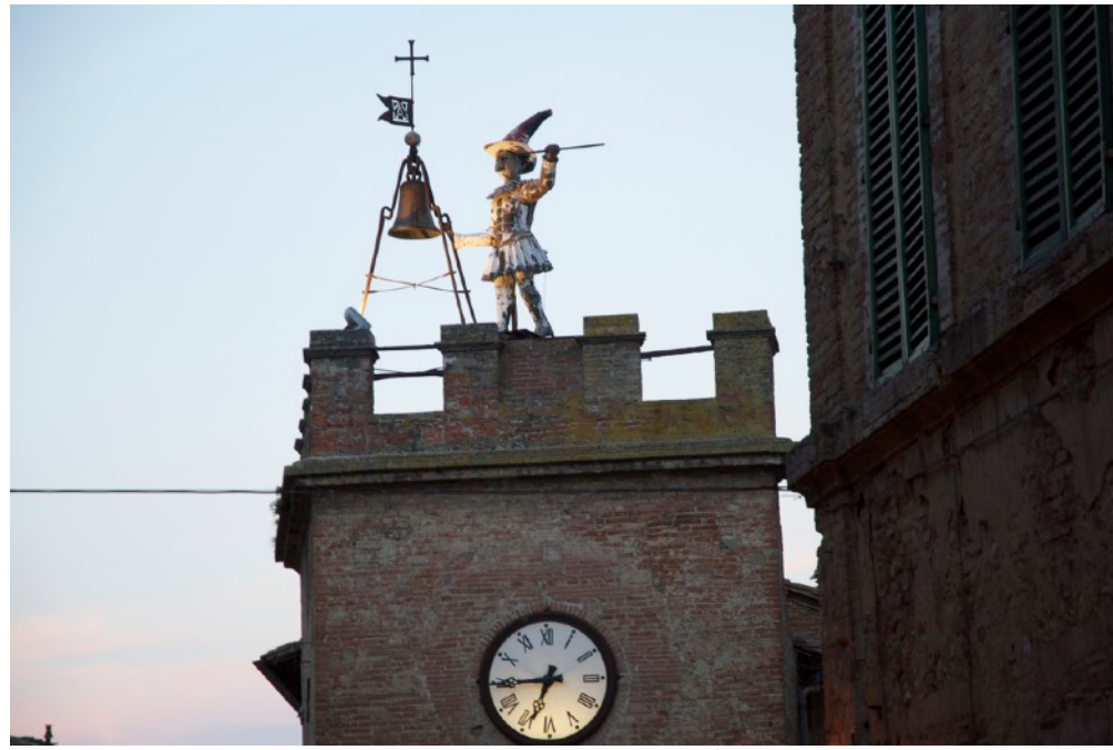
A whimsical bell ringer sits atop the 15th-century clock tower in the Piazza Grande of Montepulciano.

Tuscany offers so many things to see and do that it's difficult to mention all the cities and towns