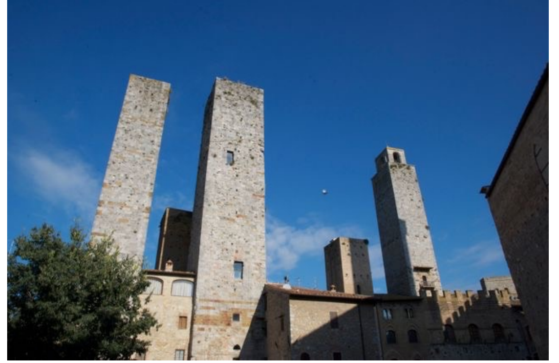
Only a few medieval towers remain of the more than 70 built in San Gimignano during the 14th century. At that time, many wealthy families would build a tower not only for defense but also as a way to show off their prosperity.