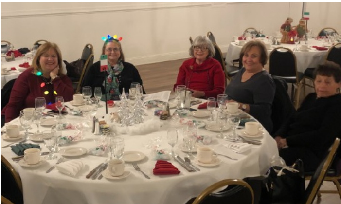
Ladies Auxiliary members enjoy their Christmas dinner indoors at the Dante Club.