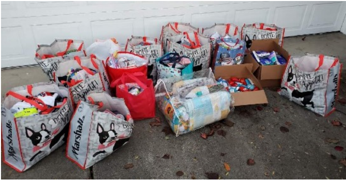
Goody bags full of socks, toiletries and other personal items gathered by auxiliary members await donation to Child Protective Services for children in need.