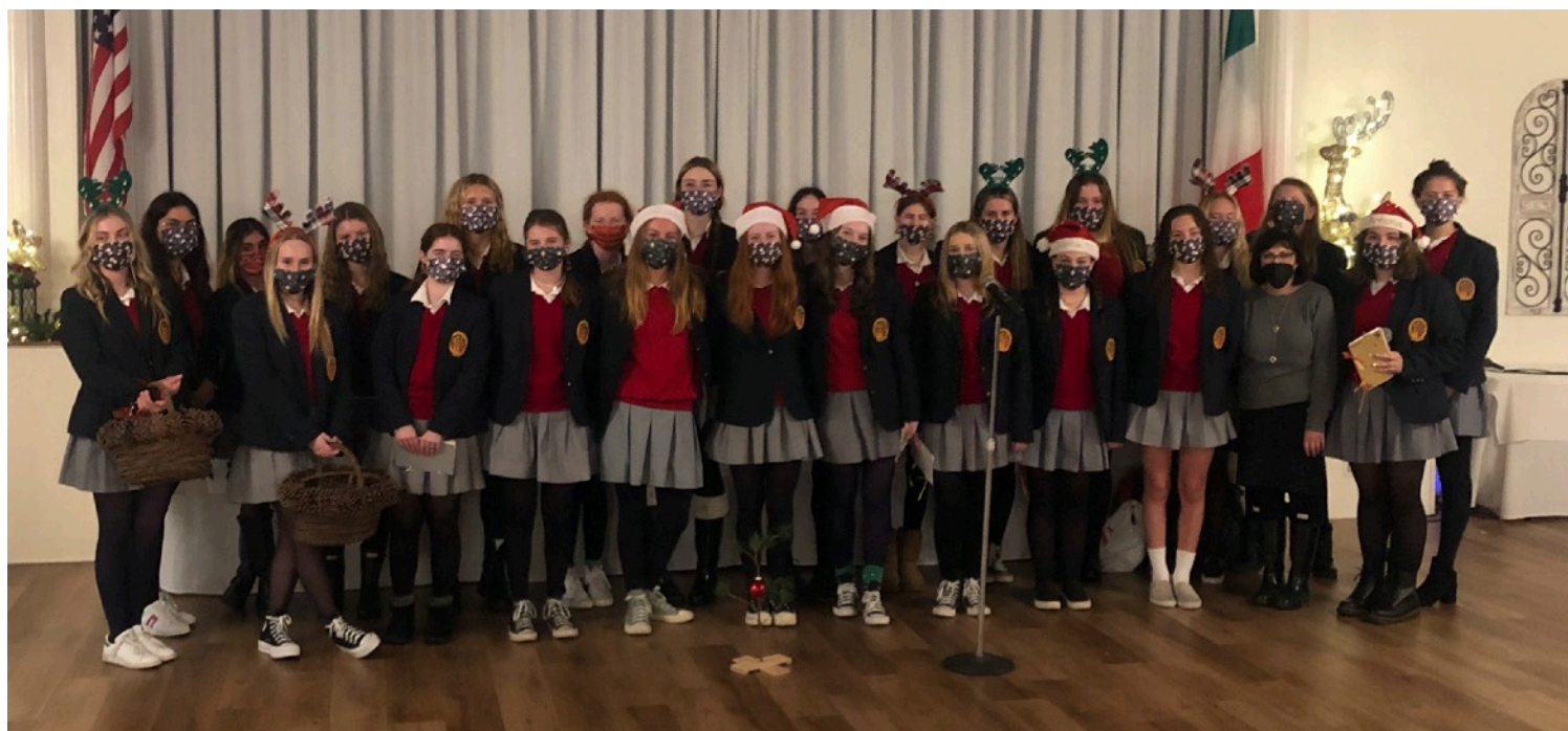
The St. Francis High School Italian Club entertain during the Ladies Auxiliary's December dinner meeting. The girls sang Christmas carols in Italian, inviting the audience to join in.