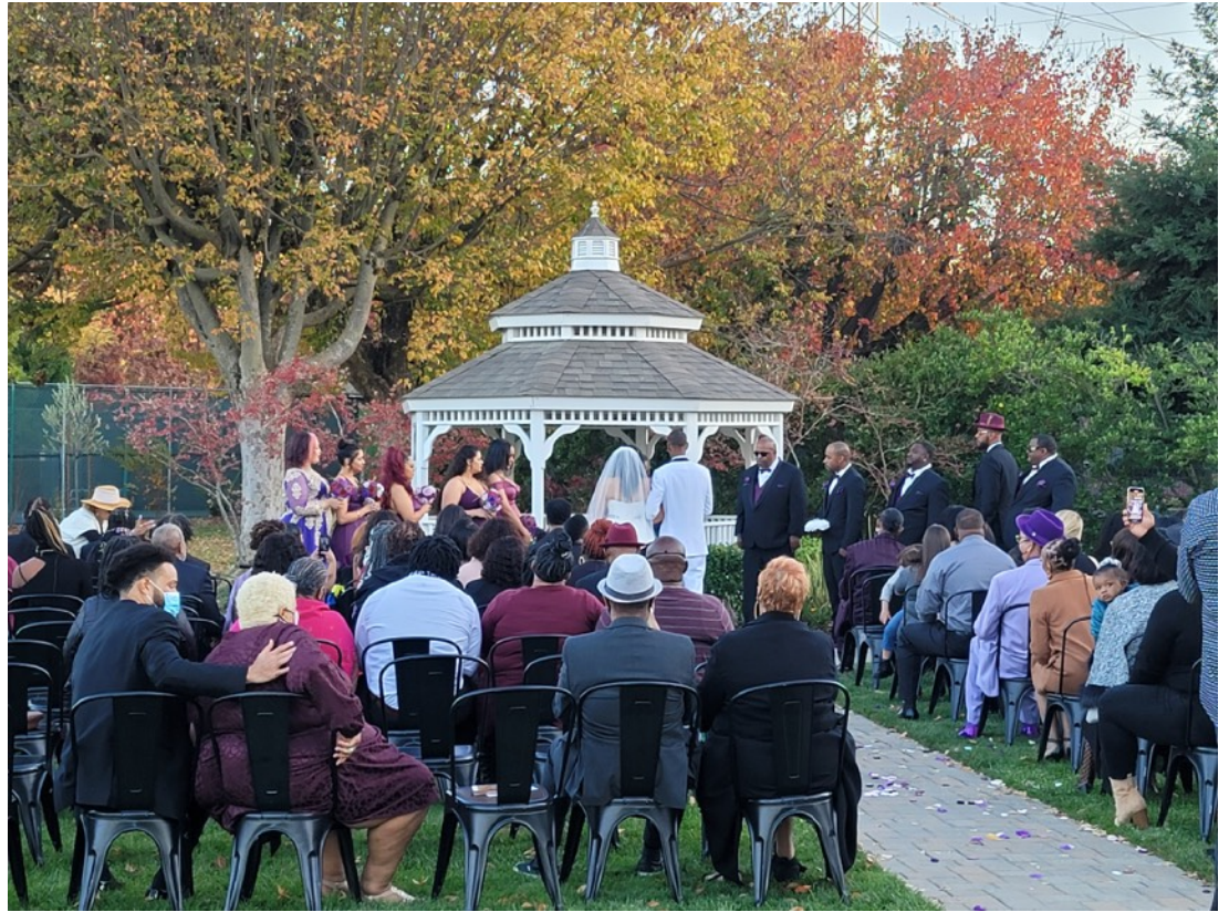
A November wedding in the Dante Event Center's outdoor gazebo was among many bookings during the past year.

Event center enjoys solid bookings through 2021