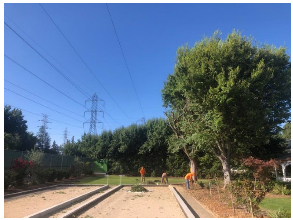
Two trees near the outdoor gazebo undergo trimming as part of ongoing efforts by George Procida and his building and grounds crew to keep the Dante Club campus looking coiffed. The trees were targeted for maintenance after PG&E identified them as growing too close to power lines.