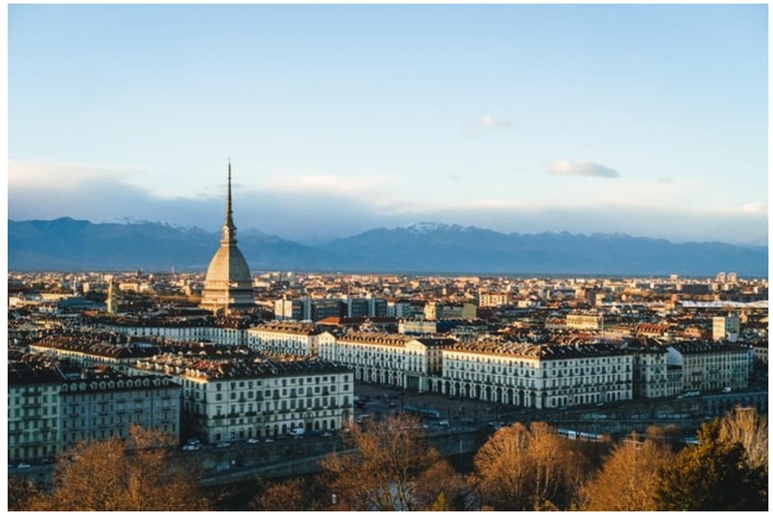
Turin, the capital city of the Piemonte region, is a key cultural and business center in Northern Italy. The city is known for its many restaurants, churches, palaces, piazzas, parks, theaters and art galleries, as well as its wealth of Baroque, Neoclassical, Art nouveau and Rococo architecture.