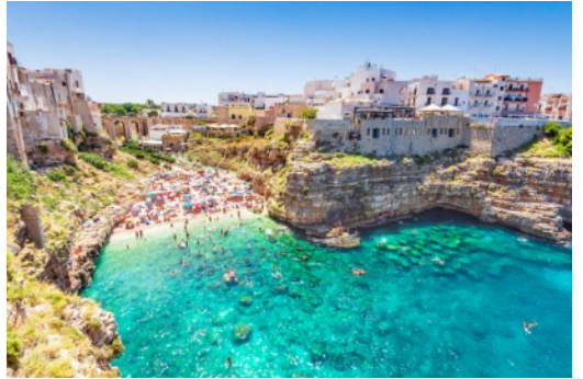
Beautiful beaches abound in the Puglia region of Italy.

The Appia Way project, which began in Rome in 312 B.C., connects Rome to Brindisi on the