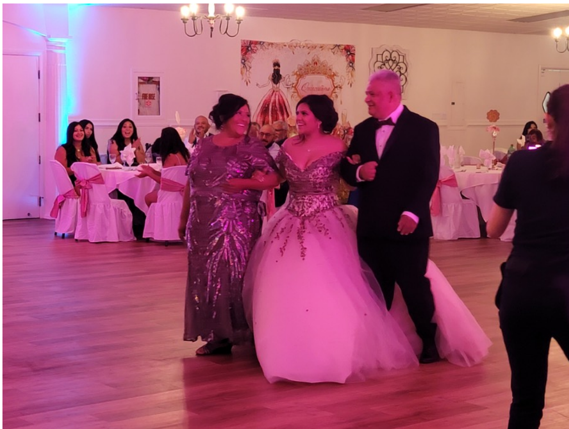
A young woman and her parents, above, are the picture of joy during her summer quinceañera at the Dante Event Center. A 10-year-old with a summer birthday celebrated with a Barbie theme, right.