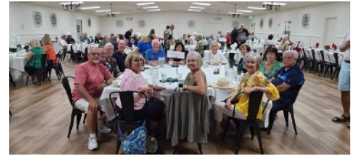
A crowd of diners, left, gathers around the grill to make sure their steaks are cooked to perfection during the August barbecue at the Dante Club. Guests brought their steaks indoors, above, where they added the meat to other menu delights, including Italian potato salad, rigatoni and grilled vegetables. About 200 people attended.