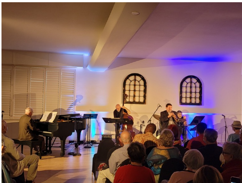
A Sacramento Jazz Society concert honoring the music of Chet Baker drew interest in July at the Dante Event Center.