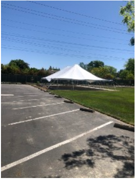
Landscaping will soon enhance the new outdoor tent area.

so outdoor events can take place regardless of the time of year.