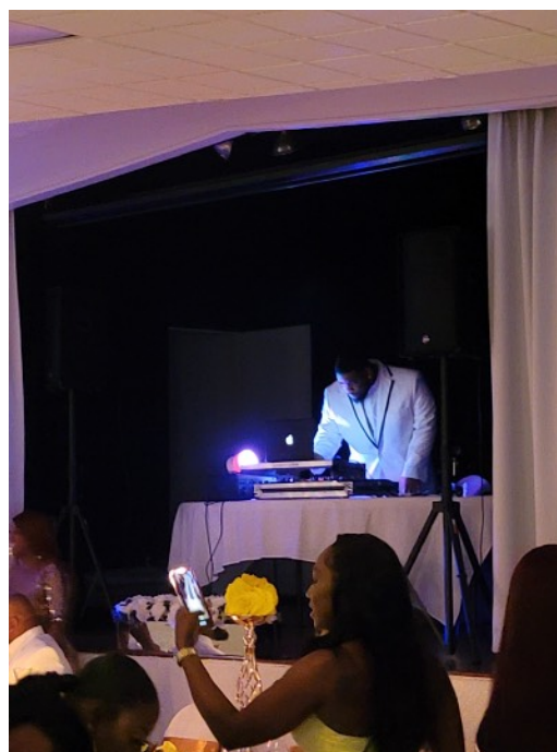
A DJ sets the mood for a wedding at the Dante Club.