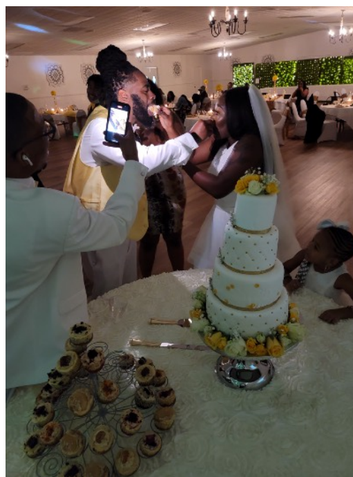
Newlyweds dive into the standard cake-eating ritual during a recent wedding in a newly redecorated Dante banquet room.