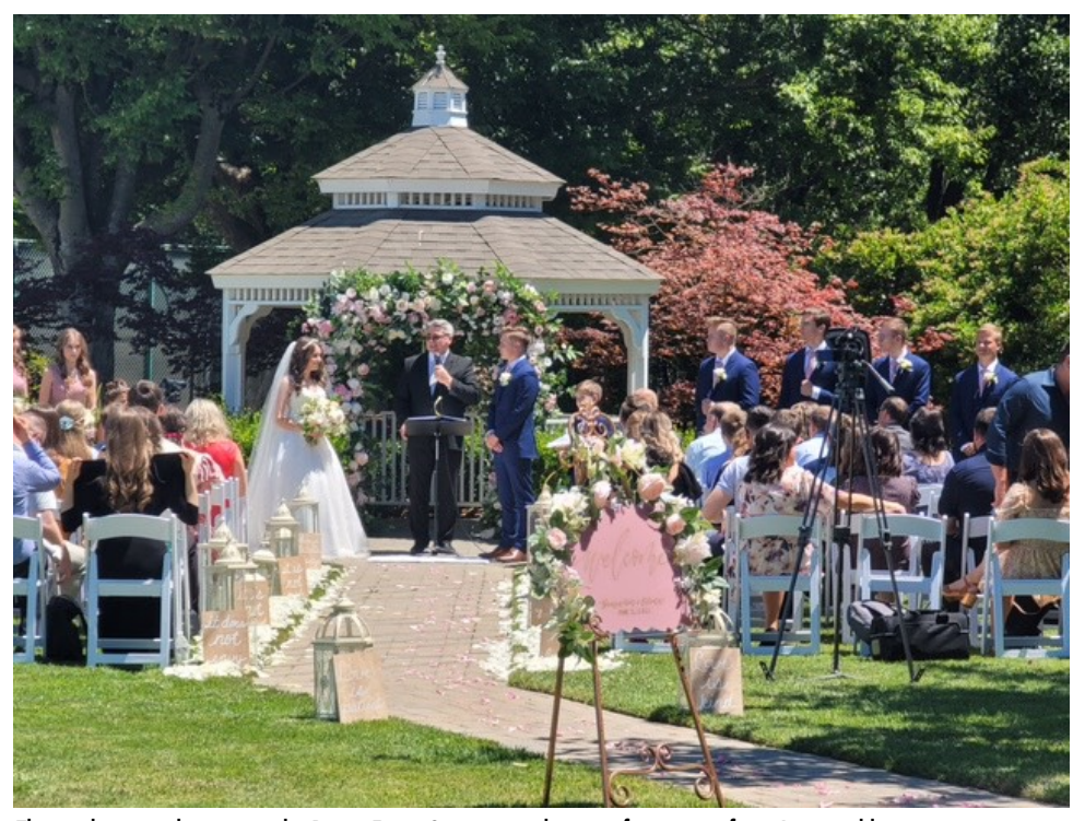
The outdoor gazebo area at the Dante Event Center provides a perfect setting for a June wedding.