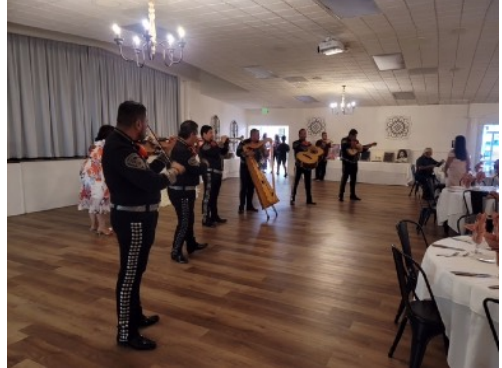
Our renovated banquet rooms offer customers a way to celebrate their special events, whether the occasions call for colorful mariachi entertainment or loving family remembrances. Beautifully prepared food, of course, is a given at the Dante.