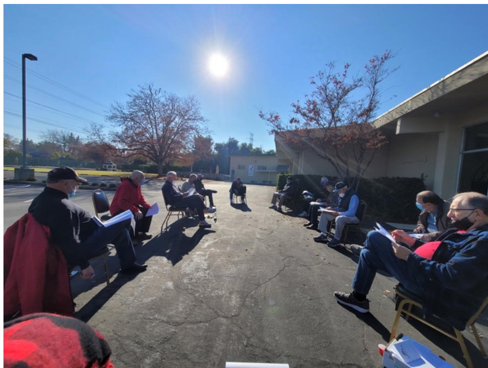
Masked and distanced Dante Club board members meet outside Dec. 20 to discuss plans for 2021.