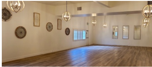
The Tuscan Room has a bright and updated look, with new flooring and Italian-flavored wall hangings and lighting.

1. The roof of the main building needs preventive measures to ensure its longevity. Needed work includes scraping, sealing, applying, replacing and inspecting.