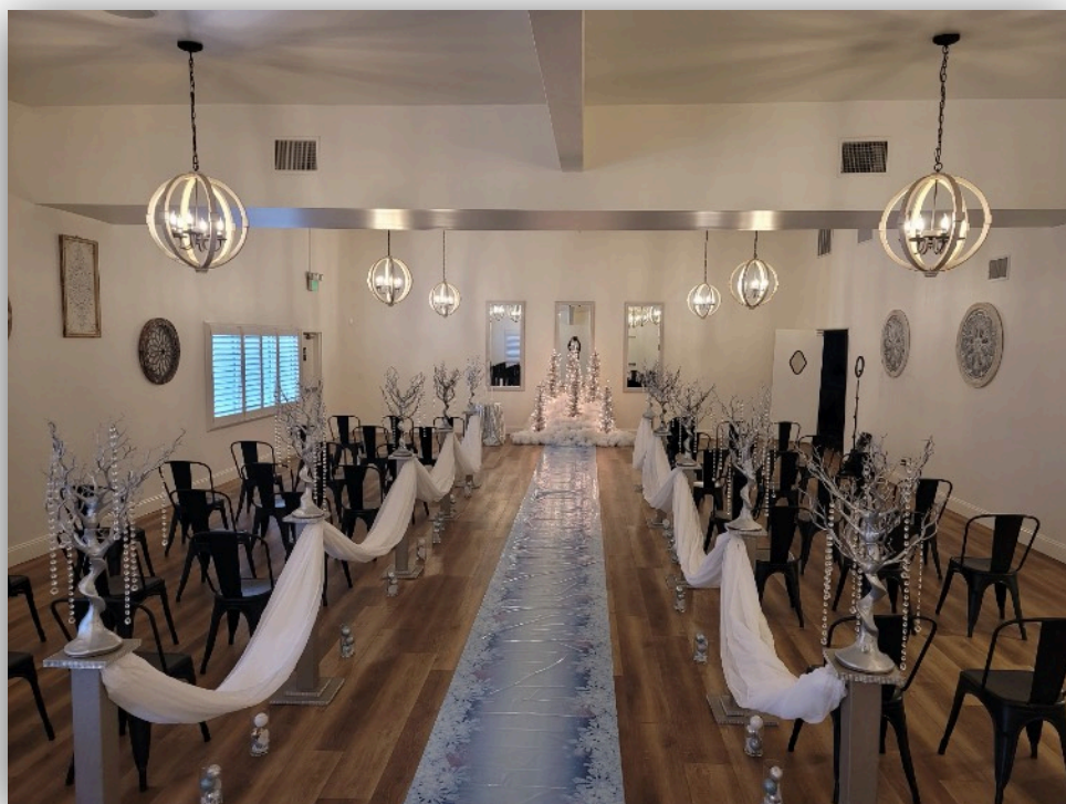
Dante Event Center rooms get transformed with elegance for, above, a wedding and, below, another recent event.