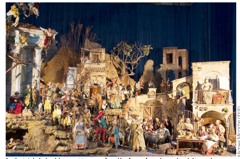
Families in Italy display elaborate nativity scenes, often adding figures of everyday people and objects to the scenes.