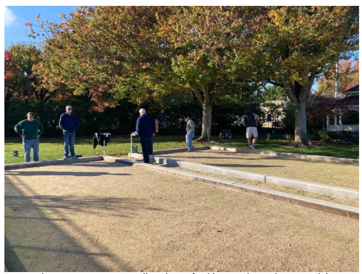
Bocce enthusiasts prepare to get rolling during final league play at the Dante Club.

Teams have braved the cold and damp weather but still show up to enjoy the bocce experience, with a few good cigars, lots of laughing and maybe a little grappa.