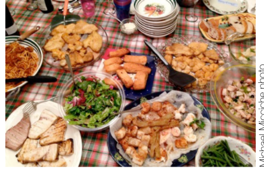
Many Italian families serve an array of fish dishes on Christmas Eve as a way to mark the Festa dei Sette Pesci.

La Befana is a Christian transformation of the pagan Roman goddess Bastrina, who protected children and dressed col vestito alla Romana, in Roman