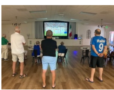
The Dante Club's dedicated soccer coaching staff keeps a close eye on player performance as Italy beats England 3-2 on July 11.

On July 11, we had the Euro Cup in our own backyard, and it was a great day for the Italian Azzurri. Dante Club members enjoyed watching an exciting