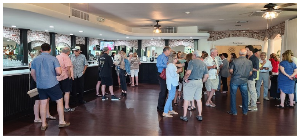
The Dante Event Center treated an estimated 200 people, including representatives of area businesses, to specially prepared refreshments and tours of the remodeled facility.

Our space goal could not have been achieved without the support of a team that was laser-focused on completing it. The effort was more than 10 years in the making, but See PRESIDENT'S CORNER, Page 5