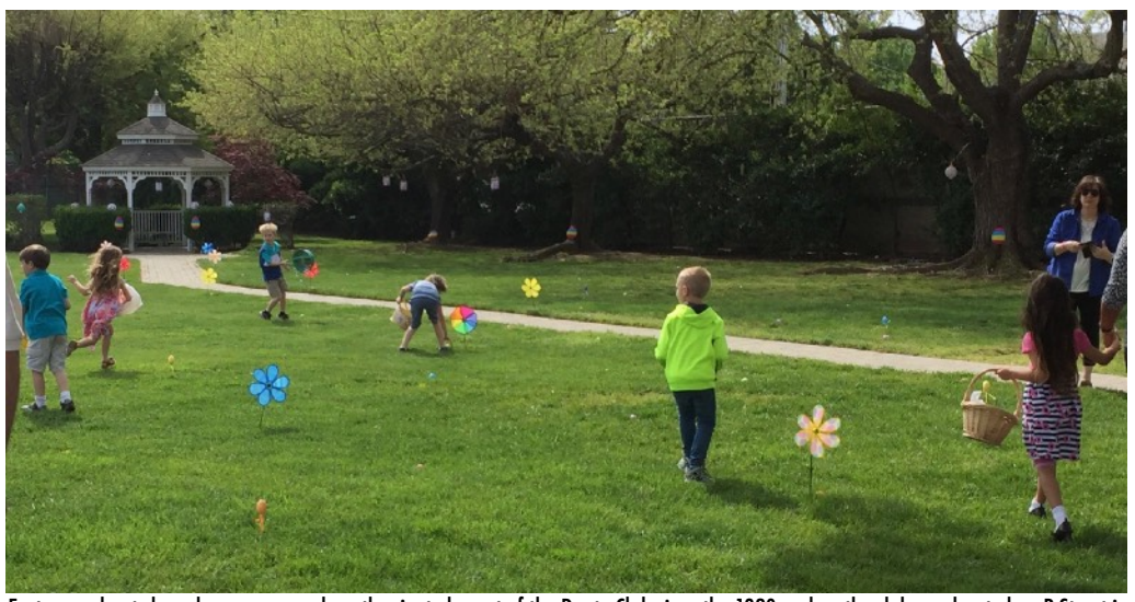
Easter egg hunts have been an annual youth-oriented event of the Dante Club since the 1920s, when the club was located on P Street in downtown Sacramento. The tradition continues, above, as egg hunters of 2018 invade the current club grounds on Fair Oaks Boulevard. The 2019 event, below, offered children not only egg hunting but also a petting zoo with lambs and goats.

But by the mid-20th century, other purposes evolved to support the immigrants—specifically, the preservation of the Italian language and its unique culture and the encouragement of music, drama, fine art, literature, athletics and social activities.