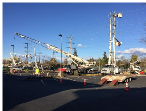
Crews with the Sacramento Municipal Utility District replace wooden electrical poles with stronger ones made of reinforced metal.