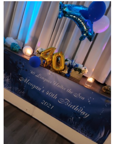
A wedding and a birthday celebration were among events held recently at the Dante Event Center.

reviews and many thank-yous from our guests.