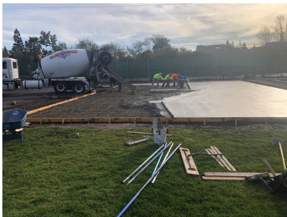
As part of ongoing improvements, workers lay a cement pad to allow for installation of a tent for outdoor events.