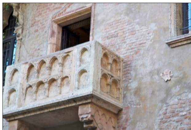
Juliet's Balcony adorns a Gothic-style museum in Verona.

I hope these photos from my trips to Italy will rekindle the urge to visit. They're just a taste of what awaits. Viva Italia!