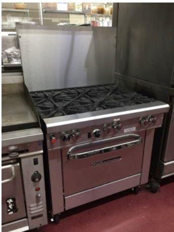
A new stove and oven are now installed in the Dante Club kitchen, along with a new charbroiler with a stand.

In the men's and women's bathrooms, wallpaper has been stripped, and our busy workers are in the process of mudding, texturing and painting