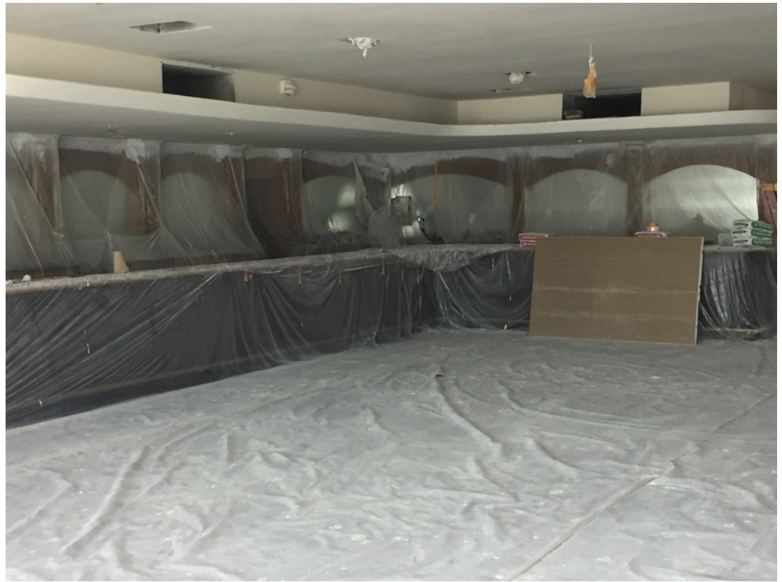
The Dante Club bar area is draped in plastic during renovations that have included removal of the bar's dated popcorn ceiling.

the walls. We're waiting for new sinks, fixtures and exhaust fans.