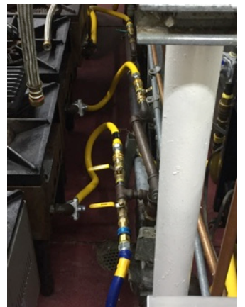
Newly installed gas lines are among multiple improvements that have been made in the Dante Club kitchen.