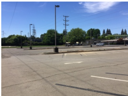
Islands in the club parking lot are temporarily unshaded after workers removed fruitless mulberry trees that damaged the asphalt.