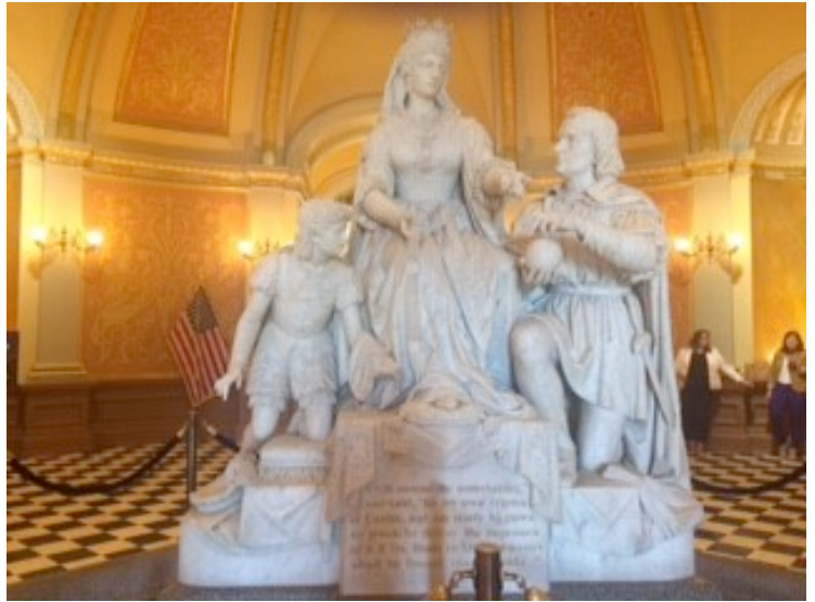
A statue of Christopher Columbus and Queen Isabella adorns the Capitol Rotunda.

"The legislators disregarded the voices of