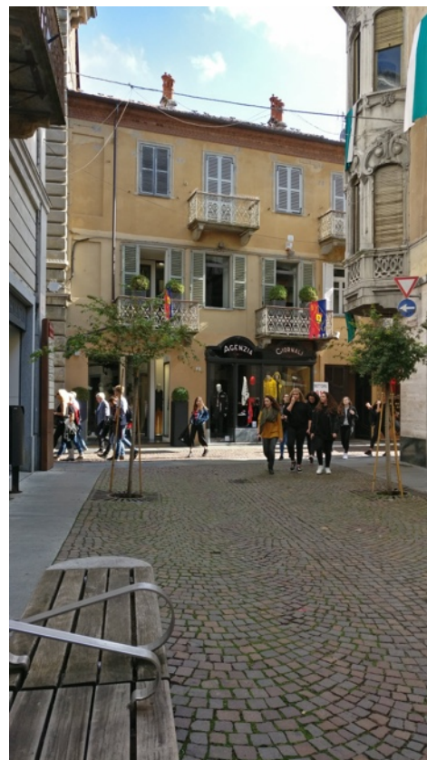
Many of the villages in the Piemonte region are small and designed to be easily walkable for residents and tourists alike.

From Torino, the rolling hills and vineyards of Alba and Asti are a short