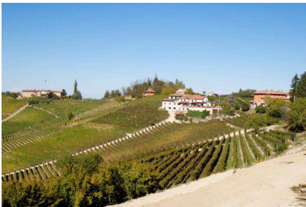
The Piemonte region of Italy is marked by charming scenes of rolling hillsides, vineyards and country estates.

I believe the Dante is now on the right track. With members' continued support of the Legacy Donation Fund, we can continue to pass on our heritage to future generations. Thank you.