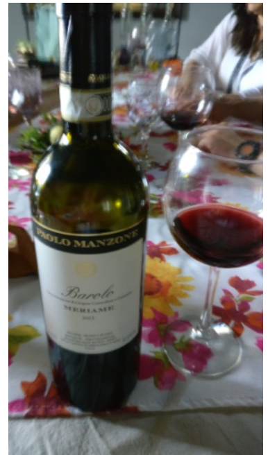
Barolo is among the many wines produced in the Alba and Asti areas of Piemonte.

From Alba, Asti is a short drive for those who like sparkling wines. A day trip to Genoa and the Riviera also is very doable.