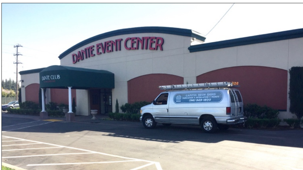
The Dante Club's new name in prominent letters now adorns the front entrance of the building.