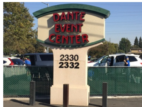
The monument facing Fair Oaks Boulevard shows the new name of the event center to passersby.

A proposal was drafted and presented to the board of directors about purchasing a large party tent that could be placed in the beautifully manicured outdoor grass area. The tent would allow our facility to continue hosting events outside while restrictions are in