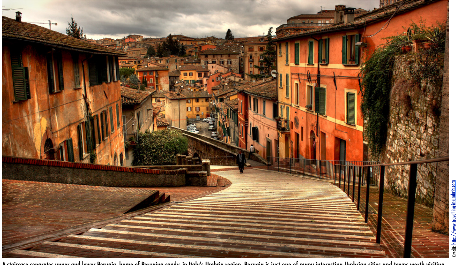
A staircase separates upper and lower Perugia, home of Perugina candy, in Italy's Umbria region. Perugia is just one of many interesting Umbrian cities and towns worth visiting.