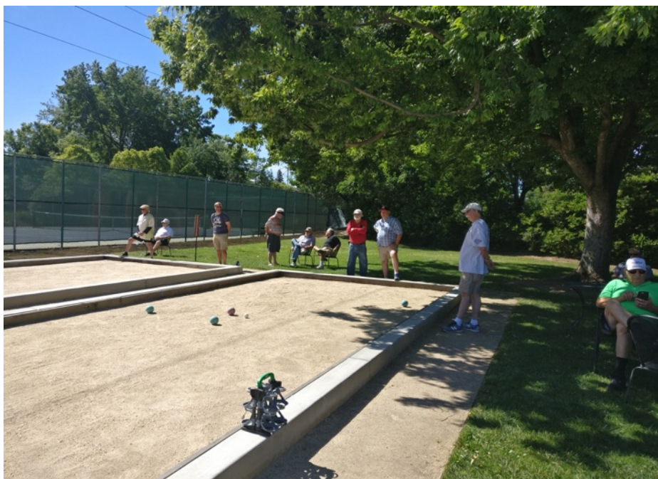
Members of the Dante Bocce Club enjoy balmy weather for their league games on June 8.