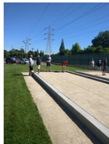
Players prepare to give it their best shot.