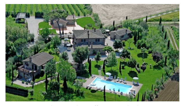
Agriturismo Rosa dei Venti, above, offers visitors the chance to stay in a villa in the Tuscan countryside near Corona. Below, visitors can enjoy this iconic view of Florence, or Firenze, from the River Arno.