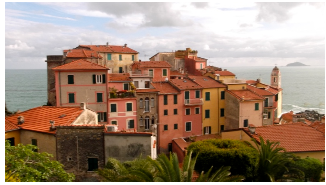
The small picturesque fishing village of Tellaro hovers on a cliff overlooking the Gulf of La Spezia in Northern Italy.

As always, if you have someone who would be a good Dante Club member, please invite them to apply for membership.