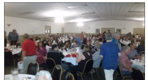
More than 300 people enjoy the annual cioppino dinner.

Thanks to all the volunteers and support staff who helped make the