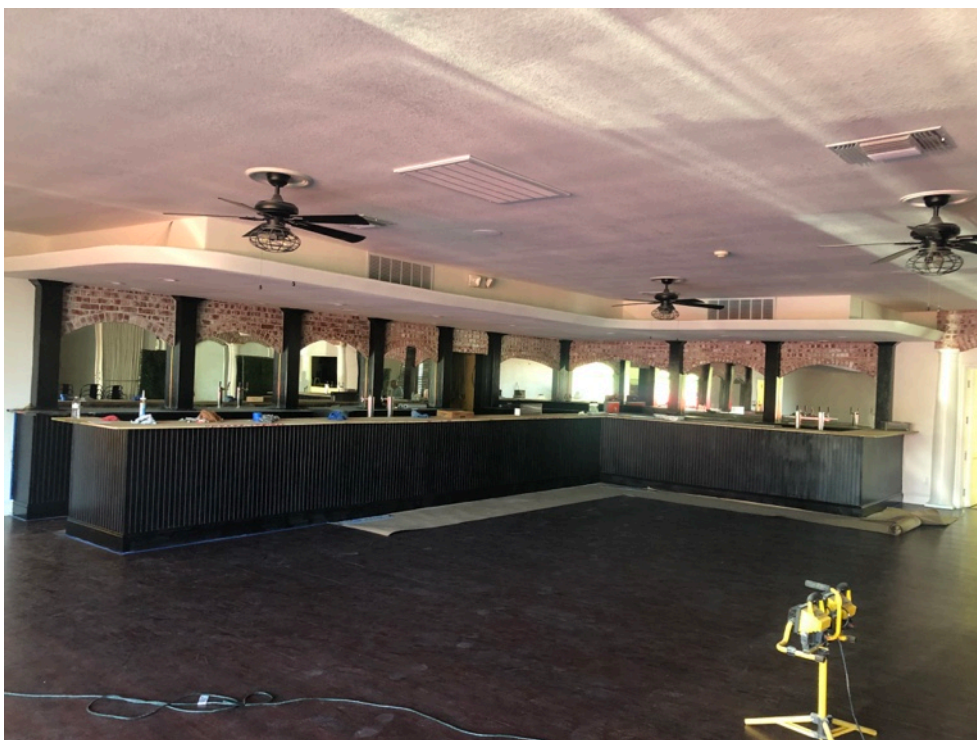
The Dante Club bar has a much-needed facelift after member workers contributed weeks of volunteer labor.