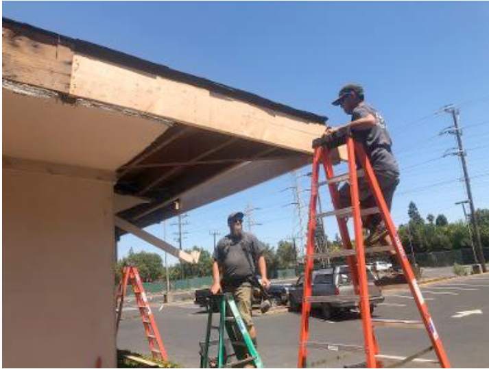
Workers repair a fascia on a portion of the building as part of the Dante Club's recent renovation effort.