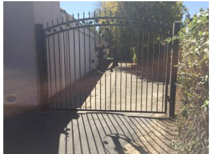
Two new decorative gates add a finishing touch to the Dante Event Center. At left is a new back gate; at right is the new gate at the front of the building.