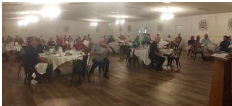
Dante Club members gathered inside the renovated, renamed facility for a dinner meeting and raffle on Oct. 20.