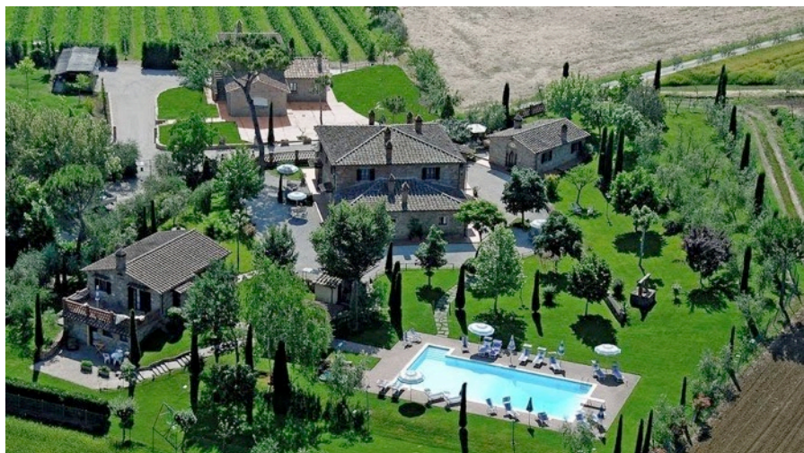
The Villa Rosa dei Venti is an estate in the municipal district of Cortona in Tuscany. It offers lodging for travelers in a scenic vineyard setting.