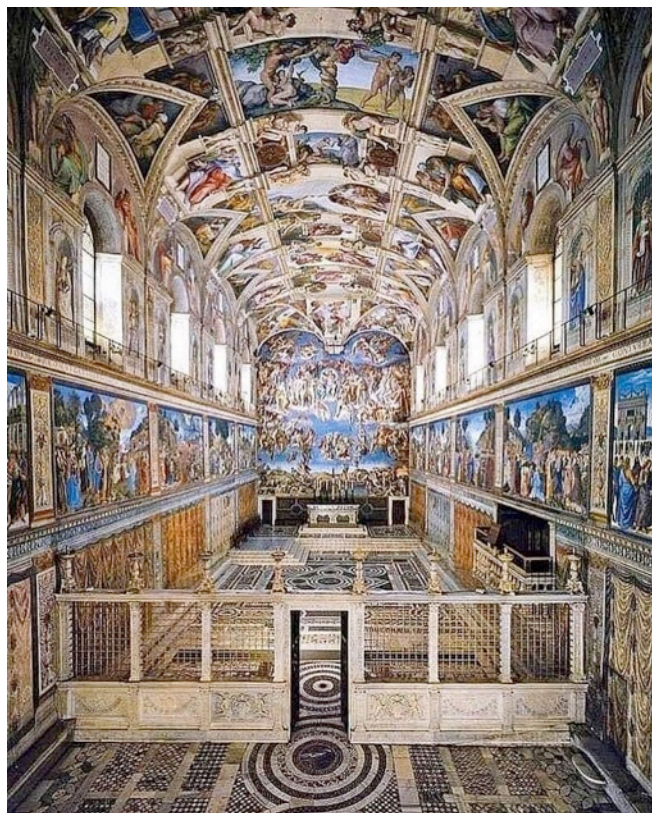
The Sistine Chapel is in the Apostolic Palace in the Vatican City State.

In all of these destinations, cars and guides can be arranged for day or overnight trips to the countryside for wine tasting, museums, historical ruins and special events.