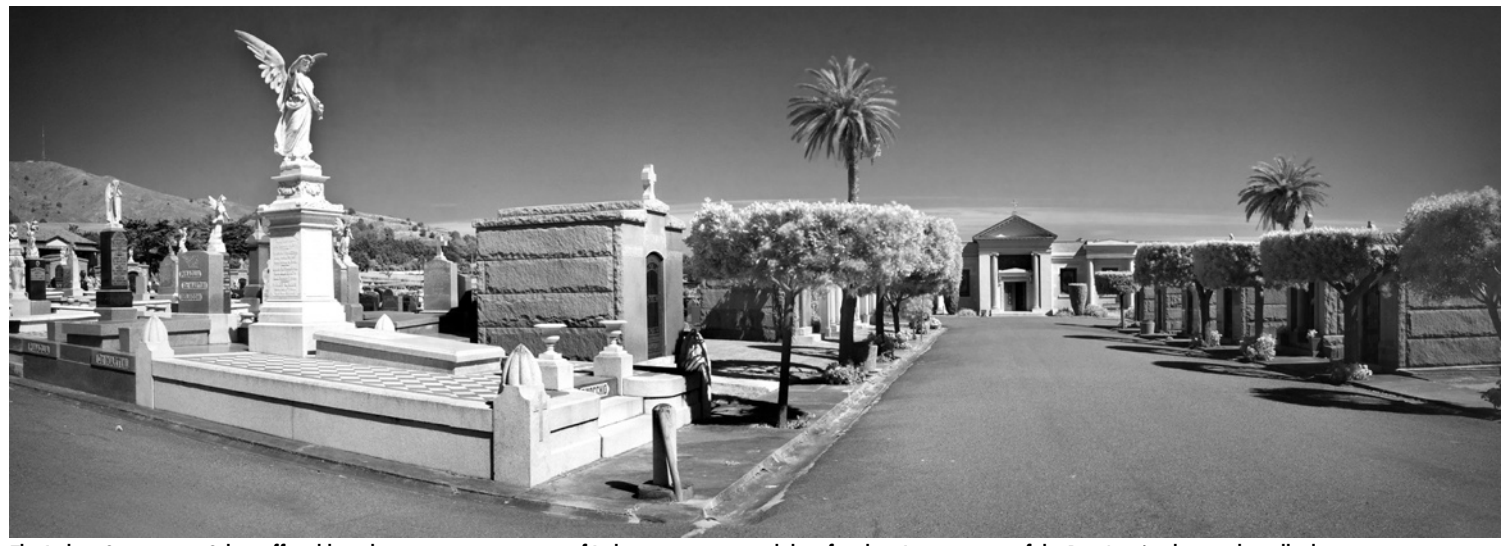
The Italian Cemetery in Colma offered burial services to generations of Italian immigrants and their families. It is now part of the Bay Area's vibrant ethnically diverse community.