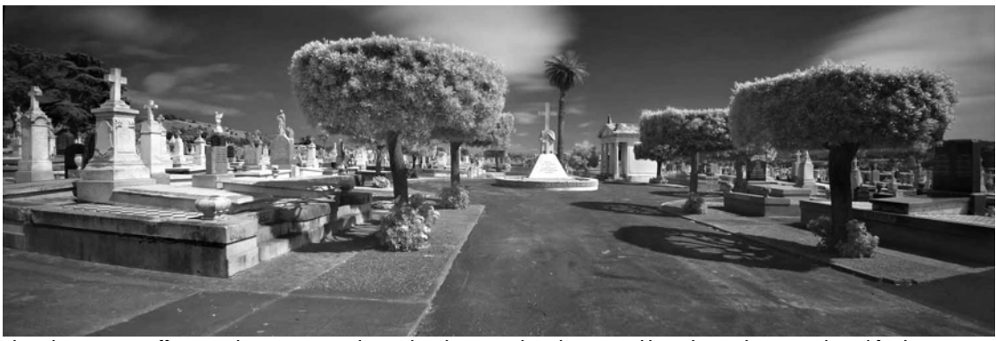
The Italian Cemetery offers entombments in nine indoor and outdoor mausoleum locations. Additional mausoleums are planned for the site.

In 1978, the Italian Cemetery was reorganized under the laws of the state of California as an