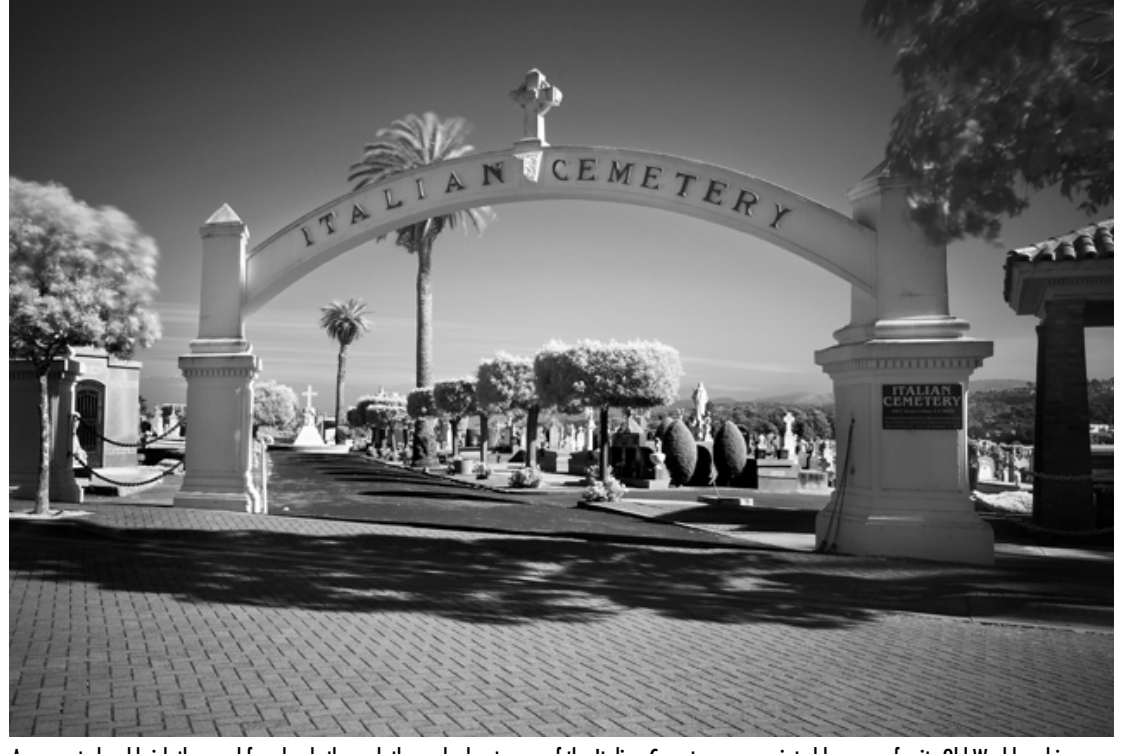
A renovated red-brick thoroughfare leads through the arched entrance of the Italian Cemetery, appreciated by many for its Old World ambience.

Many others were set up as well in the little town of Colma, which is on the San Francisco Peninsula in what is now San Mateo County.