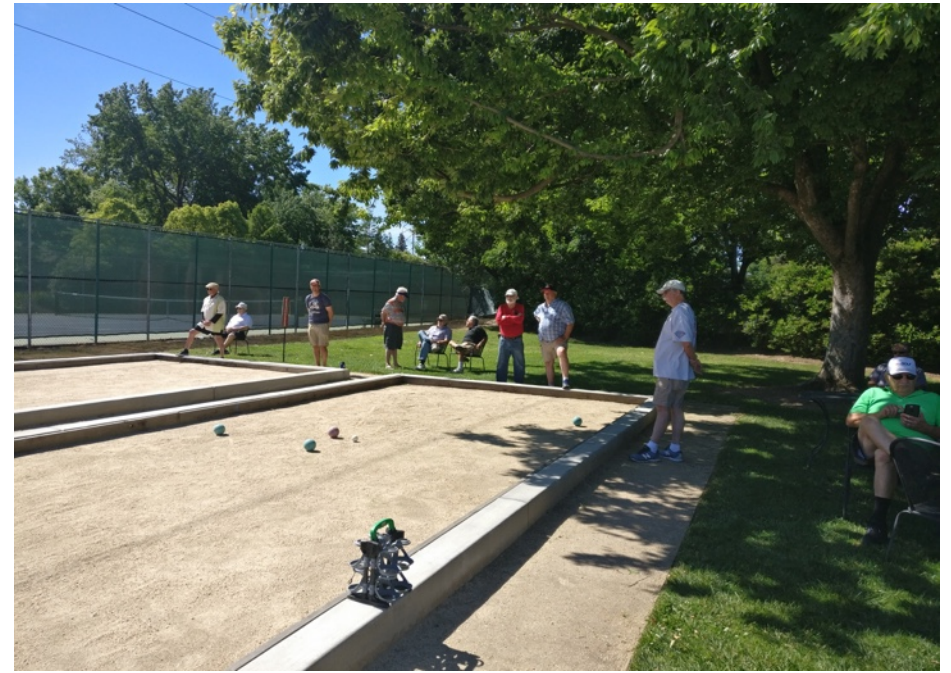
Members of the Dante Bocce Club enjoy balmy weather for their league games on June 8.

The first barbecue is July 15, featuring grill-it-yourself 16-ounce ribeye steaks. Be sure to reserve See PRESIDENT'S CORNER, Page 3