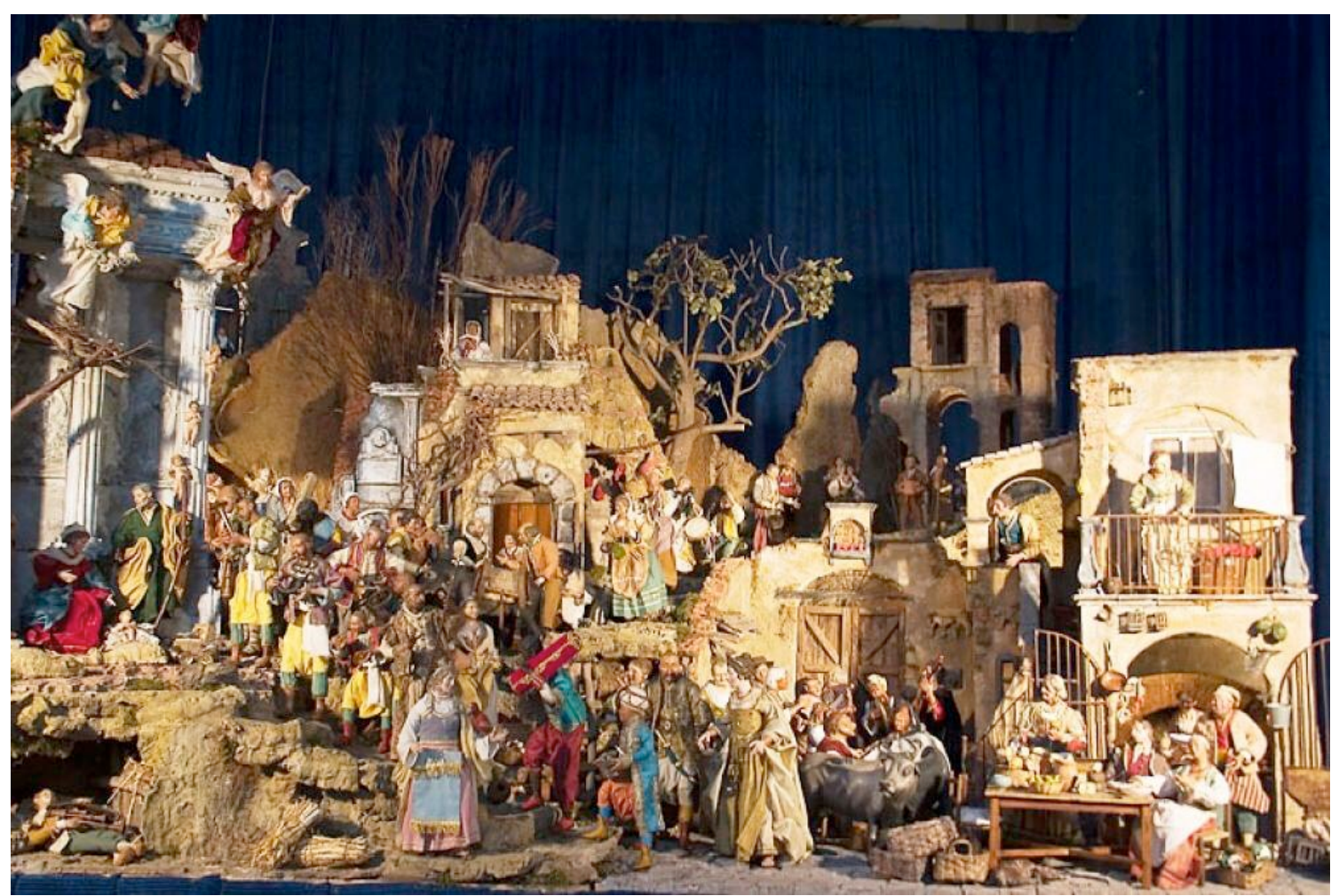
Nativity scenes like this are popular traditions in Naples. Families display the scenes in their homes, often adding figures of everyday people and objects in addition to the usual figures of the baby Jesus, Mary, Joseph, shepherds, wise men, angels and animals.