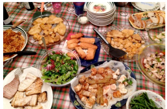
An array of fish dishes is presented during the Feast of the Seven Fishes, or Festa dei Sette Pesci. A popular tradition among many Italian-American families, the feast is served on Christmas Eve.

But, of course, the best See HOLIDAYS, Page 3