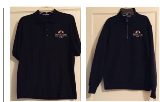
These are examples of Dante-branded clothing.

Those interested may contact Debra Cattuzzo at 916-442-2266.