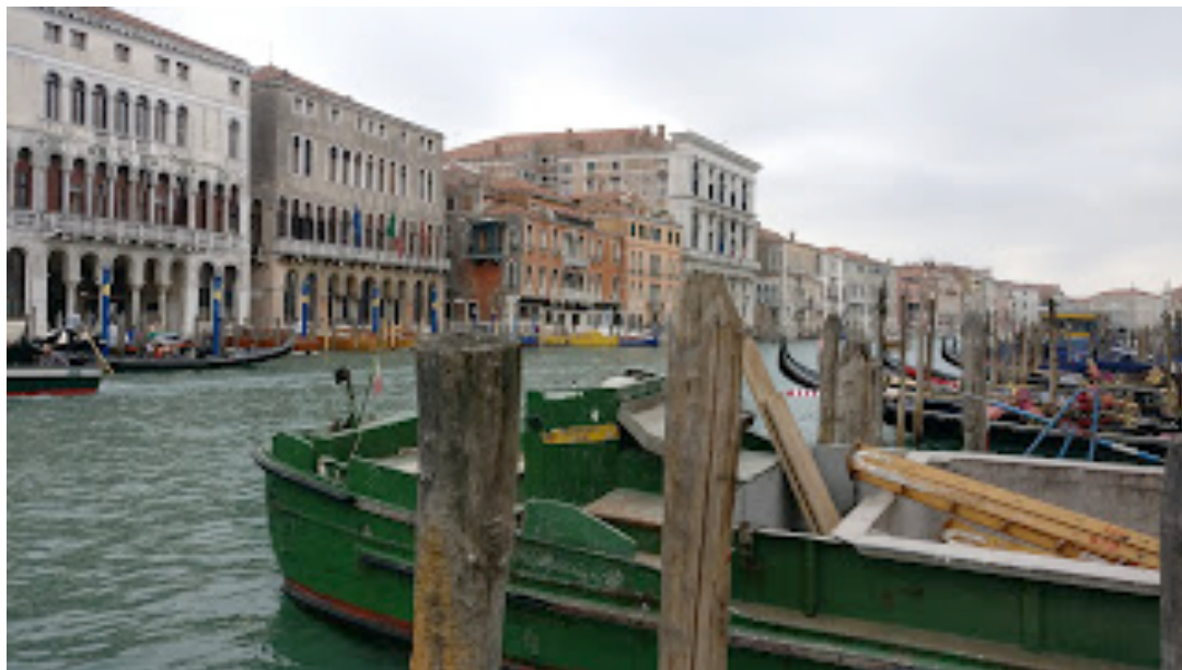
The Grand Canal in Venice never fails to capture the hearts and imaginations of travelers along Italy's eastern coast.

And, as always, we're looking for new members to keep our Italian club alive, so if you know someone who would fit the bill, please invite them to consider joining us.