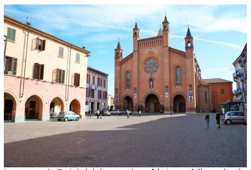
Romanesque-style Alba Cathedral, the episcopal seat of the Diocese of Alba, stands in the main piazza of the city of Alba in Italy's Piedmont region.