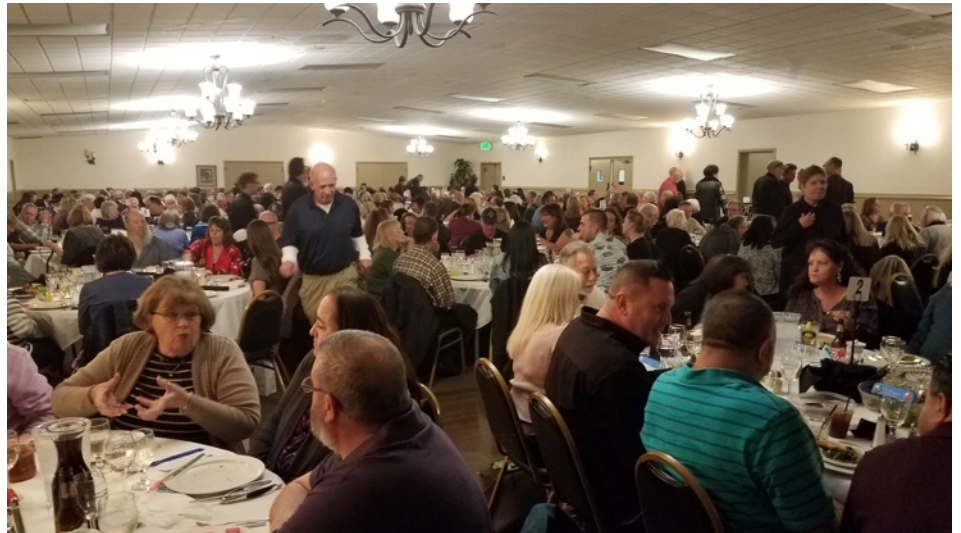
Diners packed a Dante Club banquet room Jan. 20 for the club's annual crab feed and raffle.