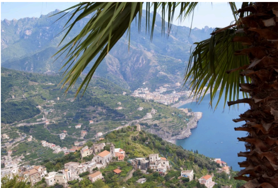
A palm tree frames a breathtaking view of the coastline of Southern Italy's Amalfi area from high above the town of Ravello. Films and photos about Italy frequently feature the area in all its picturesque glory.

You can savor some of Italy's best seafood as part of your adventure. The area is famous for