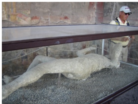
A victim, left, of the volcano that buried Pompeii is on display in the ruins. A Sorrento sunset, right, dazzles the eye.