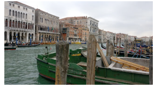
Lake Como and Venice's Grand Canal were among the many sights the travelers enjoyed in Italy.

These were among the best of them: "Best pizza and pasta I have ever eaten." "Nicest people I ever met." "Most interesting and beautiful landscapes and vistas ever." "The only way to visit, with someone who knows the language, the geography, the restaurants, the sights—and who does all the driving."