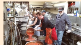
Kitchen workers manage pots of cioppino as they prepare for the 2015 dinner.