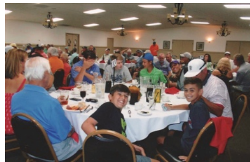
Golfers and guests enjoy a luncheon after the tournament.

The Dante Club has held the tournament yearly since the 1970s to