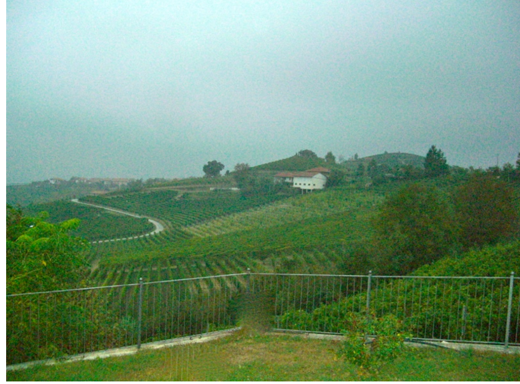
The countryside around Alba is known for its beautiful vistas, with miles of rolling green hills dotted with vineyards. Visitors looking for something different to do can experience a truffle hunt, watching trained dogs sniff out the buried treasures.

Asti, with its sparkling wines, is a short drive from Alba. Southwest of Alba, Barolo offers a spectacular interactive wine museum and opportunities to taste the town's signature wine. A day trip to Genoa and the Riviera is very doable.