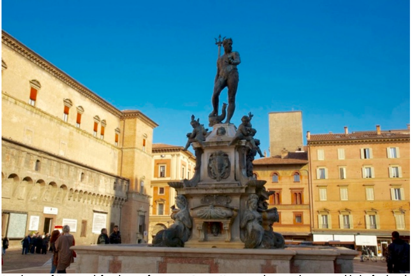
A sculpture of Neptune, left, adorns a fountain in Piazza Maggiore, the central square and hub of political and social life in Bologna. A small side street, right, shows the city's charm.