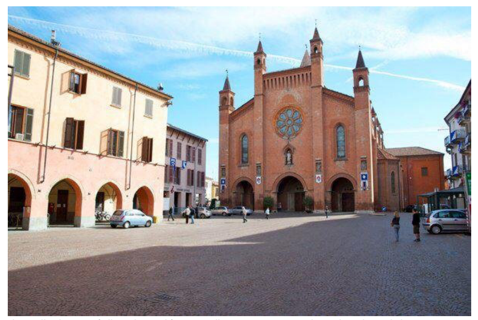
The small Italian city of Alba is designed for easy walking so visitors can easily see the sights, including many historical buildings, as in this piazza, and enjoy the city's restaurants and businesses.