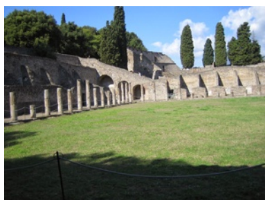
The Pompeii ruins, above, are among many historical sights in the Bay of Naples area. A victim, right, of the Mount Vesuvius eruption that buried Pompeii, playground of the Romans, evokes the horror of the 79 A.D. event.