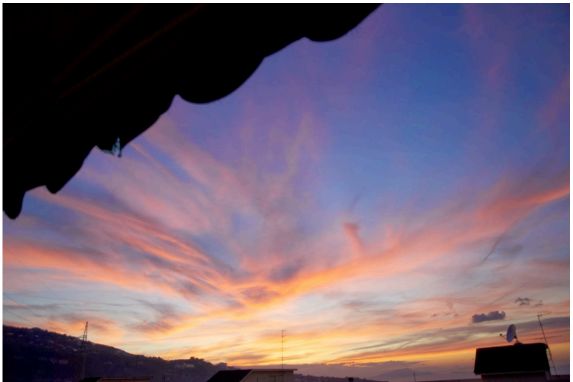
Italy travel expert Michael Micciche captured this magnificent sunset view from his hotel room balcony in the city of Sorrento.

Spectacular views and picturesque villages go on for miles in this part of Southern Italy. You will never regret having spent time in this truly romantic place. And you will want to "ritorno a Sorrento."