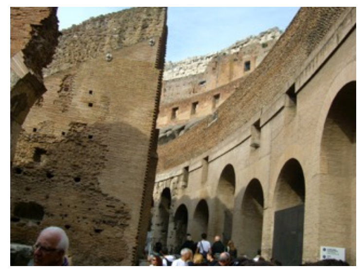
Visitors explore the interior of the Colosseum, among the many world-famous and popular tourist attractions in Rome.

Try the carbonara, Rome's most notable dish, or cacio pepe (black pepper) or spaghetti alle