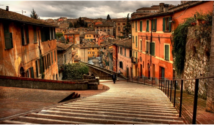
A staircase separates upper and lower Perugia, home of Perugina candy.

One of the prettiest towns is Castiglione del