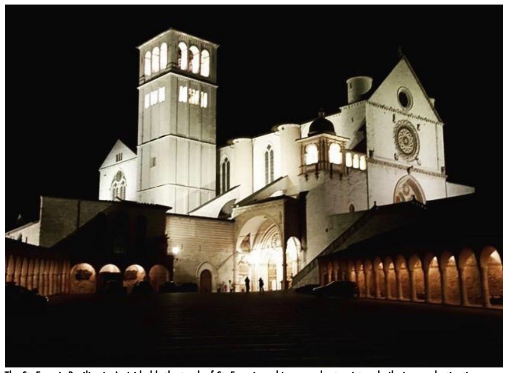
The St. Francis Basilica in Assisi holds the tomb of St. Francis and is a popular tourist and pilgrimage destination.